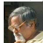
Figure 1: The pensive Professor

Now, try to stick a picture at a specific place, relative to a paragraph of text. Like this. Now, try to stick a picture at a place, relative to a paragraph of text. Now, try to stick a picture at a place, relative to a paragraph of text. Now, try to stick a picture at a place, relative to a paragraph of text. Now, try to stick a picture at a place, relative to a paragraph of text. Now, try to stick a picture at a place, relative to a paragraph of text.